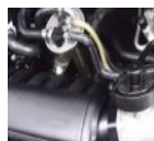
ENGINE OILS, OPERATIONAL FLUIDS AND ADDITIVES