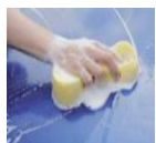
CAR CARE PRODUCTS