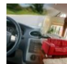
CAR AIR FRESHENERS