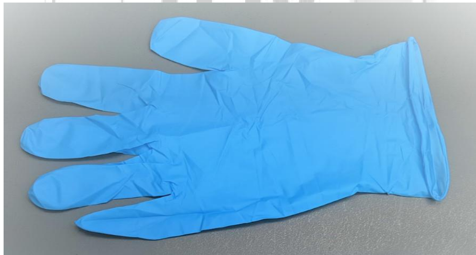
Photo: Disposable Nitrile Exam Gloves (NBR), Blue, Lot No. YL-216388, Size M