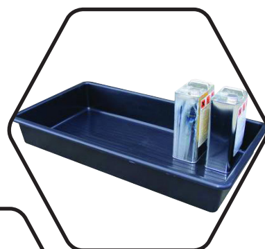
Model TT65 comes without removable grid